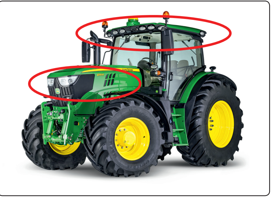
6 SERIES UTILITY TRACTOR