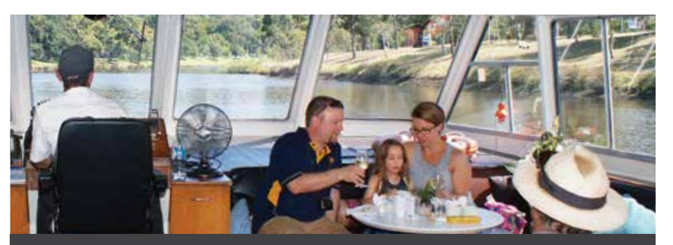
Melba Star passengers can enjoy the captain's commentary and a conversation without engine noise and vibration.

"The John Deere 6.8L is a fully commercial engine, with 250-hour service intervals," explains Bird. "On the Melba Star , it is configured to its M4 rating of 223 kW (300 hp) at 2500 rpm. This engine is common-rail fuel injected, so it is very fuel-efficient compared to the previous engine." An excellent choice for cruising the Yarra River.