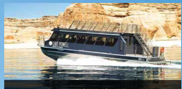
Each engine consumes 57 liters (15 gallons) per hour at a 30-knot cruise.

Distributor: Cascade Engine Center in Seattle, Washington; www.cascadeengine.com