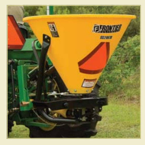
Frontier SS2067B Broadcast Spreader is compatible with the iMatch ASAE Category 1 quick-attach hitch system. iMatch converts your tractor's 3-point hitch to fixed hooks and attaching points for quick and easy connection. (iMatch sold separately and must be ordered from factory as iMatch.)