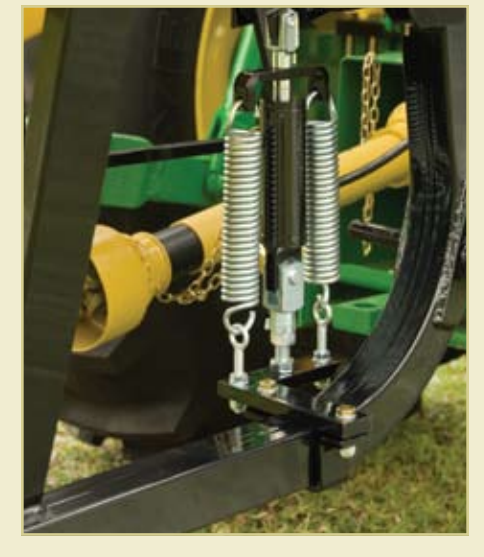
The optional hydraulically controlled SCV lever opens the spreader gate to drop seed and fertilizer, conveniently from the seat of your tractor. (SS11 & SS12 Series only.)