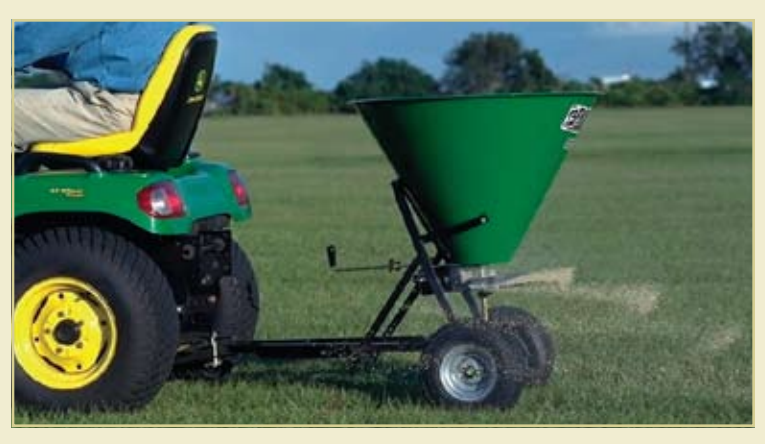
The Ground-Driven Broadcast Spreader hooks up to small tractors or ATV's and is perfect for working your garden, nursery, greenhouse, or athletic field. Plus, this versatile tool can spread salt over snow- and ice-covered pathways.