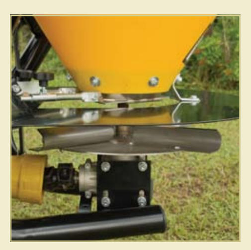
Adjustable stainless steel fins let you change the spread pattern from left to right to center to control your distribution pattern. And the rugged, corrosion-resistant spreading disc helps protect and extend the life of the fins.