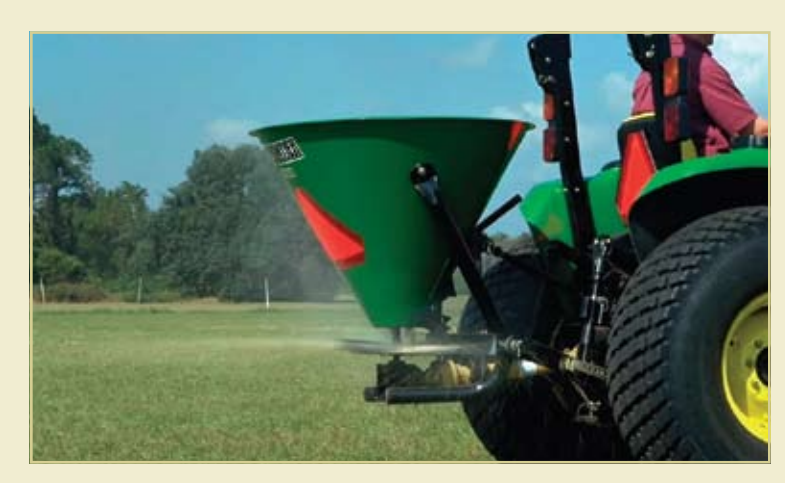
With the PTO-Driven Broadcast Spreader, you can spread seed, granular fertilizers, crystalline herbicide, pesticide, sand, and salt at 540 RPM's and in three diverse patterns. Each unit features heat-treated paint to prevent corrosion, and comes standard with a fixed agitator and shielded driveline gearbox.