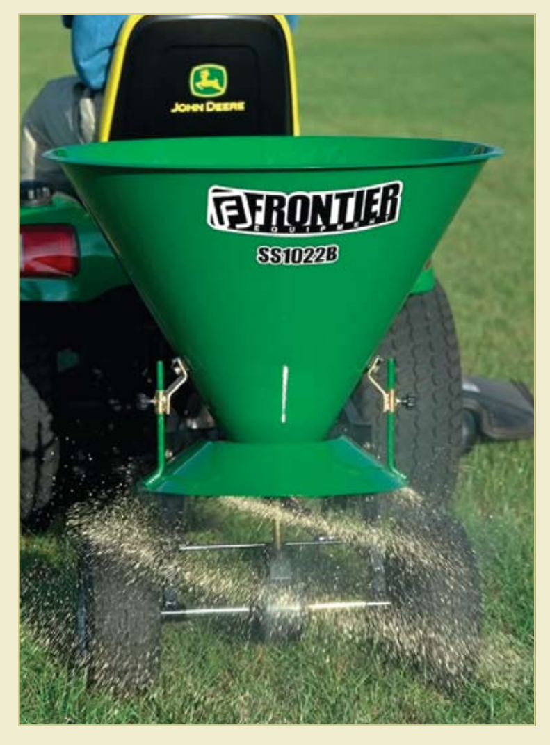
The seamless, high-quality steel 10 Series Broadcast Spreaders are ideal for a uniform spread, so you avoid overlapping. Pull behind your lawnmower or Gator™ to make quick work of small spreading chores.