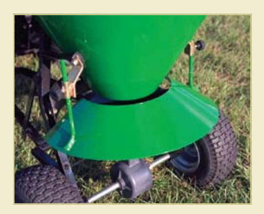
A rugged deflector shield (optional) helps ensure uniform spread swath and keeps salt on your sidewalk.