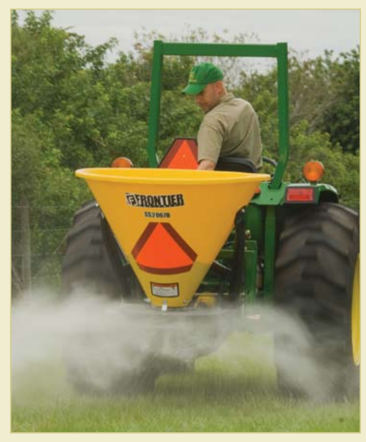
The 20 Series Broadcast Spreaders feature a polyethylene hopper and stainless steel spreading components for strong resistance to salt, sand, and other corrosive material. This helps prevent rust and weather damage to minimize maintenance and extend spreader life.