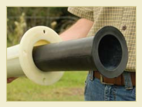
For high-moisture products such as damp fertilizers, the optional rubber insert provides a quick and easy flow through the spout.