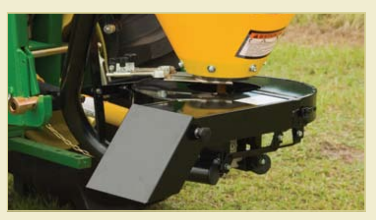
The siderow discharge deflector (optional) is easily adjusted to give you improved accuracy and control during discharge.