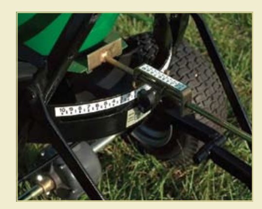
A swath control lever lets you choose either a row or broadcast spread, while also varying the direction of the pattern.