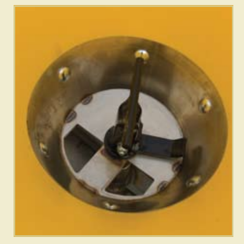
Standard agitator helps prevent clogging in the hopper when using powdered or high moisture fertilizer. The durable hopper gate is stainless steel to avoid corrosion.