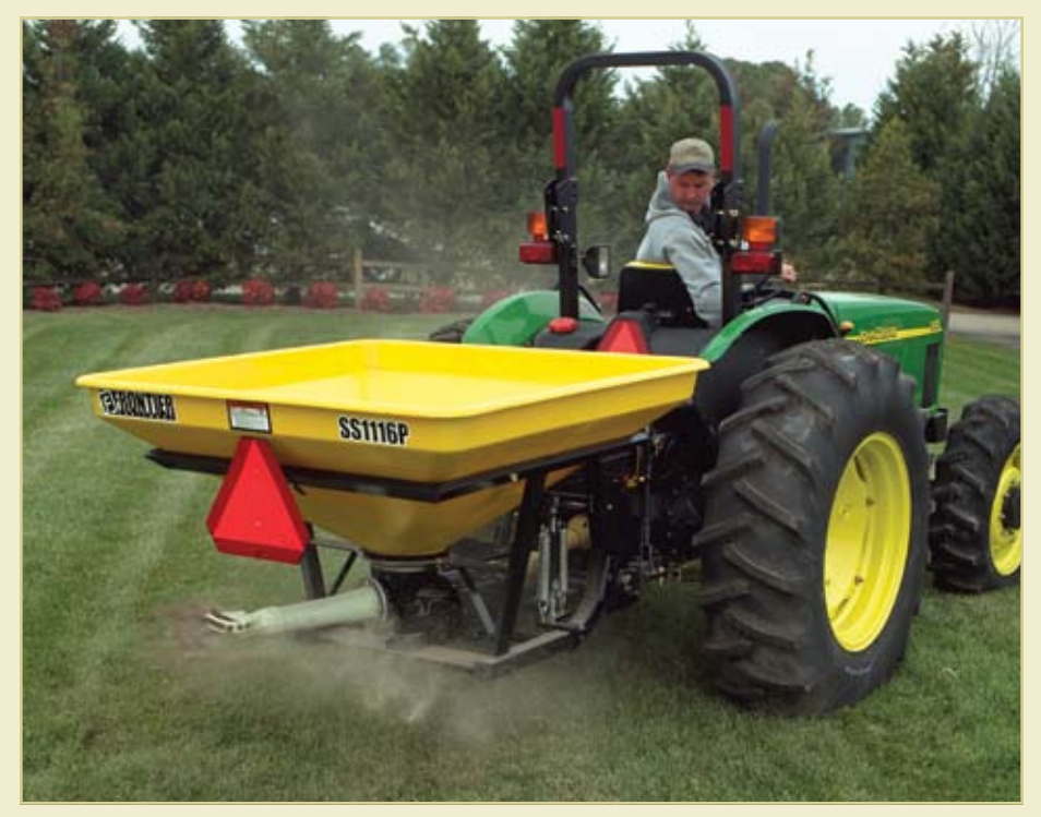
The Frontier Pendular Spreaders are equipped with reinforced fiberglass hoppers and stainless steel spreading components. Plus, the heavy-duty drive system is oil-bath lubricated for longer life.