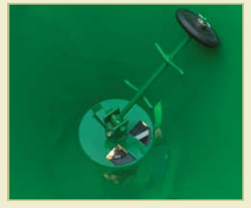
Optional wheel agitator keeps material from packing and bridging over the discharge.