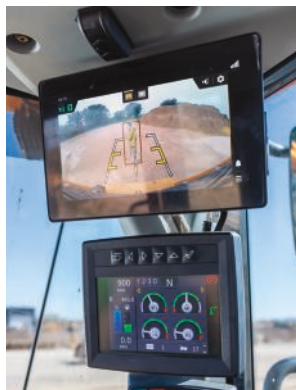
SMARTDETECT ON THE G5 DISPLAY