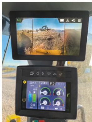
AVS ON THE G5 DISPLAY